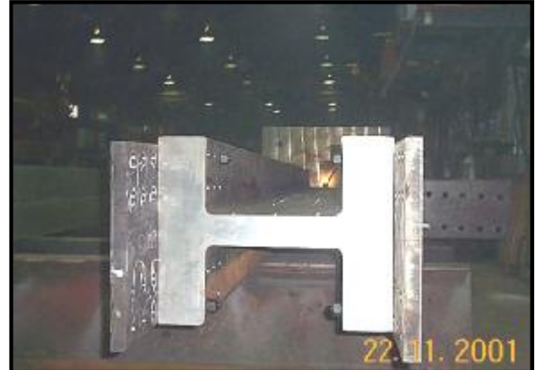
Steel Beam, Toronto Airport, Ontario