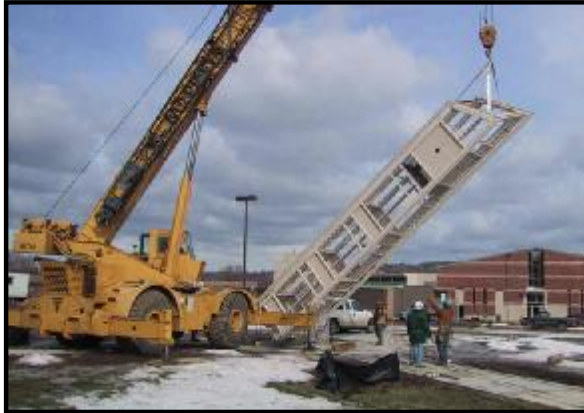
Clock Structure, Connecticut, United States