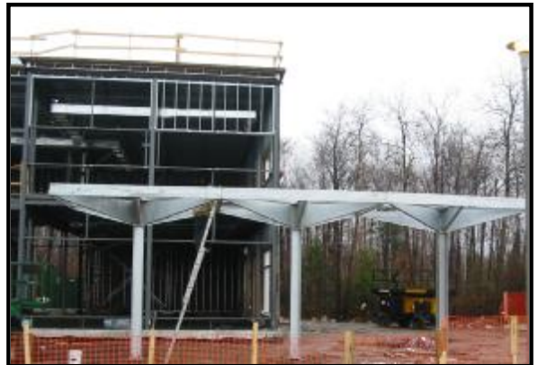
Canopy structure, Rest Area, Quebec