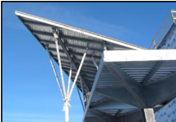
Canopy Structure, Rest Area, Quebec