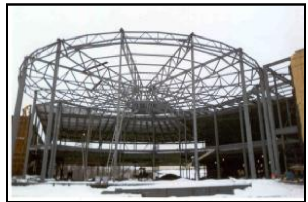
Rochebelle Training Centre, Québec