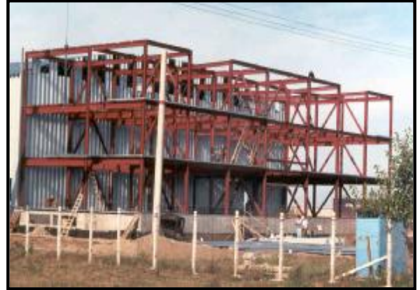
KHD Office Building, Bucharest, Romania