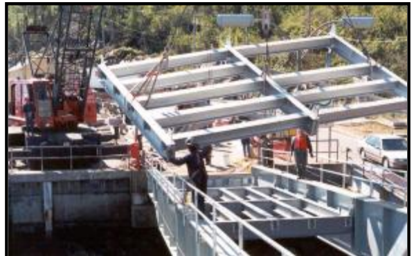
Bridge Structure, Tadoussac, Quebec