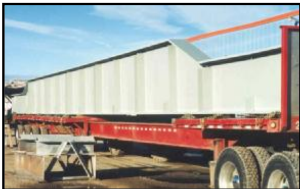
Bridge Structure, Tadoussac, Quebec