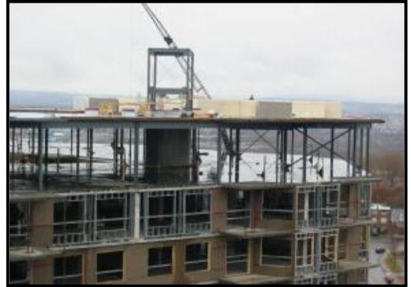
La Volière Apartment Building, Sainte-Foy, Québec