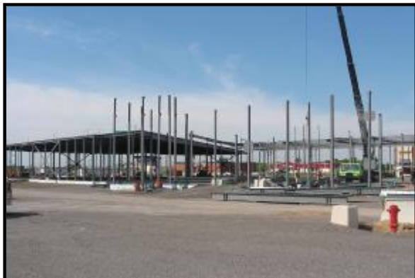
Tanguay Distribution Centre, Québec