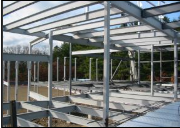
John Elliot Elementary School, Massachusetts, É-U.