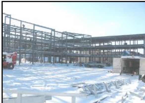
St-François Rest Home, Quebec